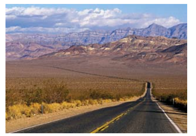
Death Valley National Park, situated south-east of the Sierra Nevada mountains, is the hottest and driest of the national parks in the United States. Temperatures in the valley can range from up to 54 °C in the day in the summer to below freezing at night in the winter.

The Metropolitan Museum of Art, the "Met" as it's popularly known, is one of the most important art institutions in the world.